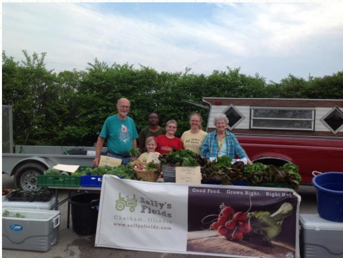
Sally's Fields CSA, Chatham, IL