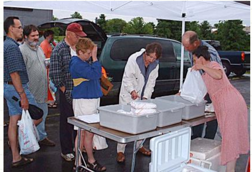
Organic Pastures Meat CSA, Eureka, IL